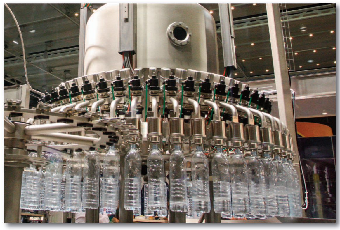
Blow moulding machine