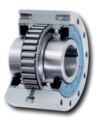
Cone Clamping Elements