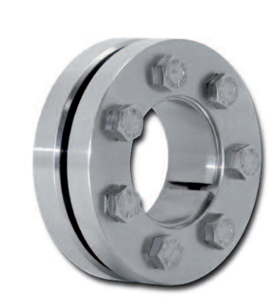
Stainless Steel Freewheels