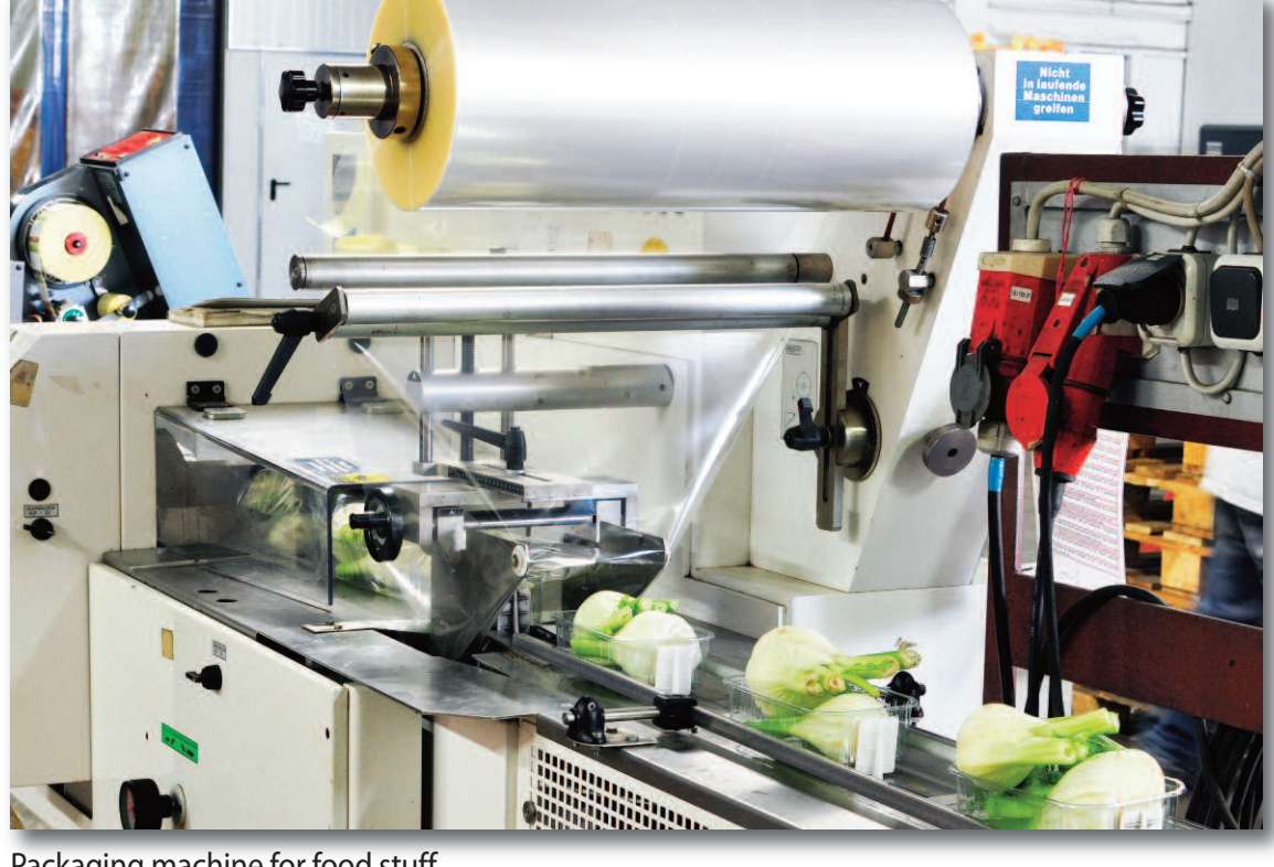
Packaging machine for food stuff