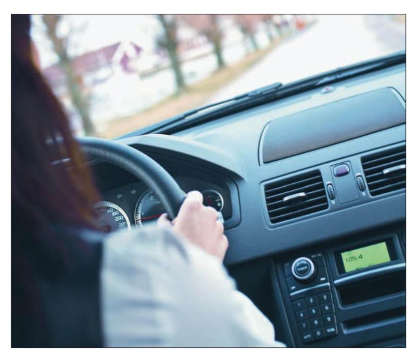
There are several textured parts in a car interior.

Uddeholm Stavax ESR, Uddeholm Mirrax ESR, Uddeholm Elmax SuperClean, Uddeholm Corrax, Uddeholm Polmax and Uddeholm Mirrax 40 can be photo-etched to the required pattern but will require a slightly different etching technique, because of their corrosion resistance.