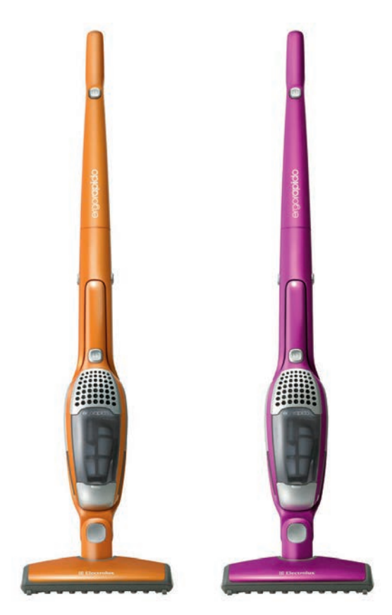
Electrolux vacuum cleaner.

The Uddeholm steel grades Impax Supreme, Holdax, Nimax, Ramax HH, RoyAlloy and Mirrax 40 were tested in the prehardened condition.