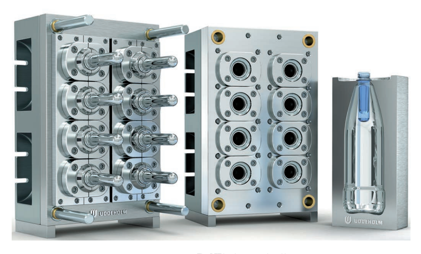
The PET bottles are produced in two steps: first injection moulding of the preforms and then blow moulding of the preforms to the finished bottle. Uddeholm Stavax ESR is a recommended tool steel for production of the preforms.