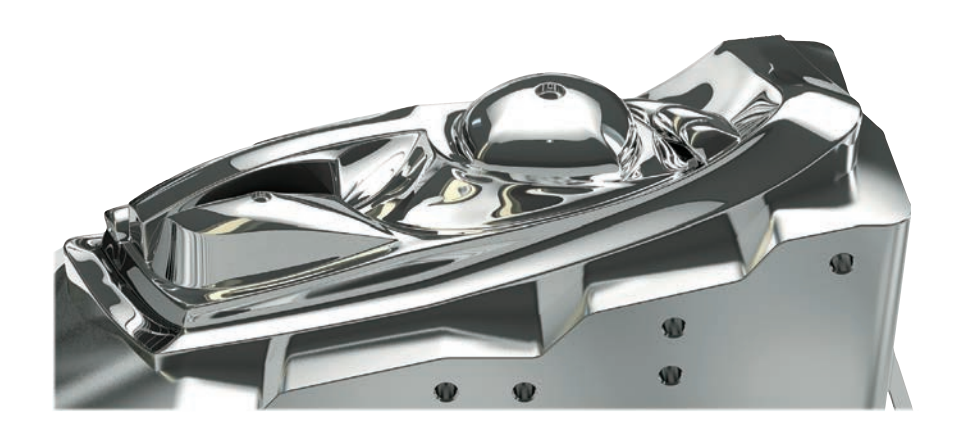
A high polished mould for production of car headlights.

Uddeholm Corrax needs only an aging process at 500-600°C (930-1110°F) and no quenching. This means that no distortion will occur, only a linear and homogenous shrinkage in the order of 0.1%. Since it is totally predictable it is easy to compensate for this shrinkage by adding stock before the heat treatment.