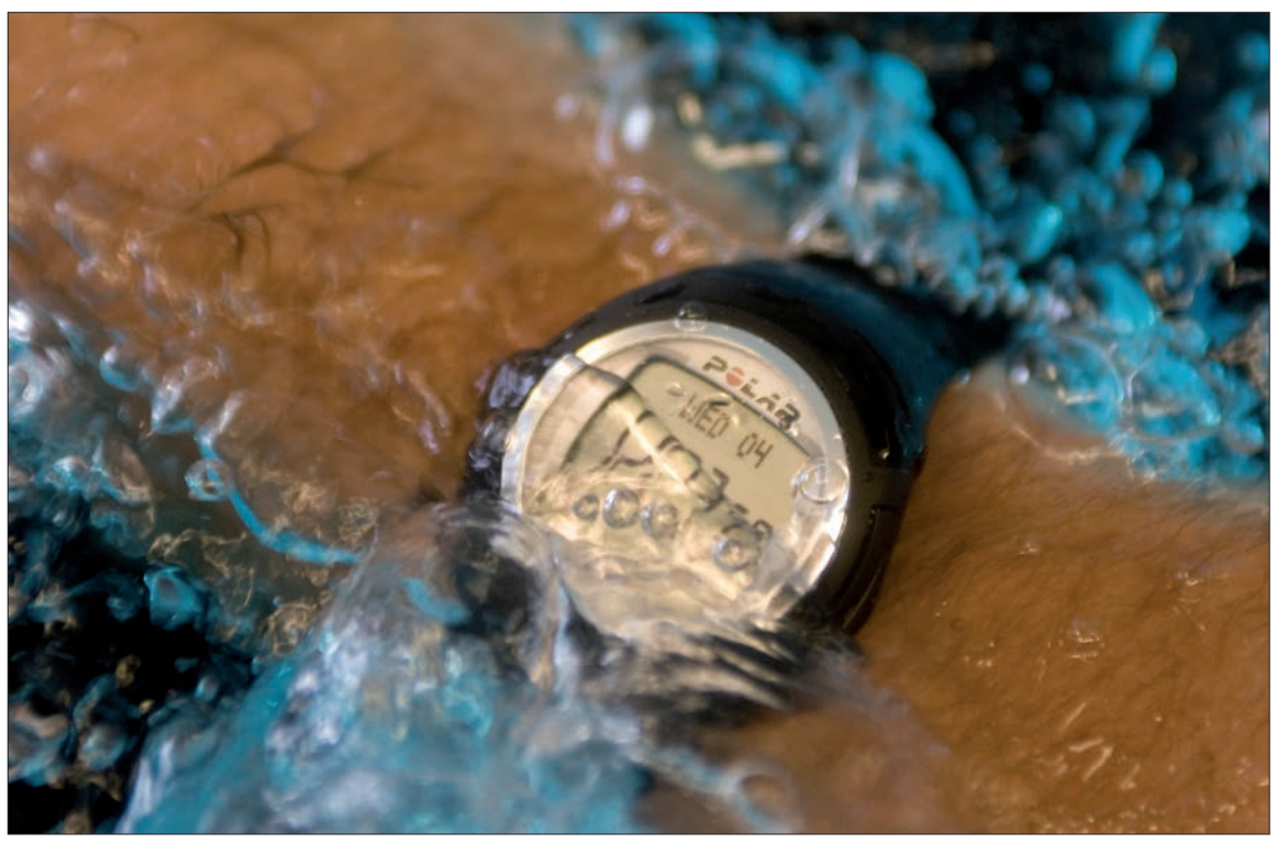
Pulse monitor. Uddeholm Stavax ESR and Uddeholm UHB 11 are suitable mould steel for this kind of production.

In this brochure we present all our high quality material used for production of plastic parts. We also focus on important factors that contribute to an economical production.