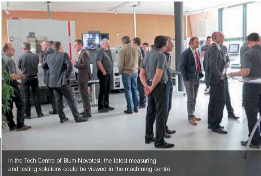
In the Tech-Centre of Blum-Novotest, the latest measuring and testing solutions could be viewed in the machining centre.

From June 15th to 17th 2015, Blum-Novotest arranged the first BLUM TECH-TALK at the headquarters in Ravensburg. A great number of customers ranging from brand name watch manufacturers to automotive groups, were informed about the latest developments of production metrology.