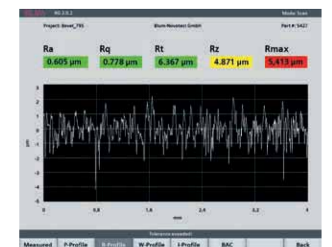
The analysis software for roughness measurement and DIGILOG technology can be displayed and operated via the control screen of the machine tools.