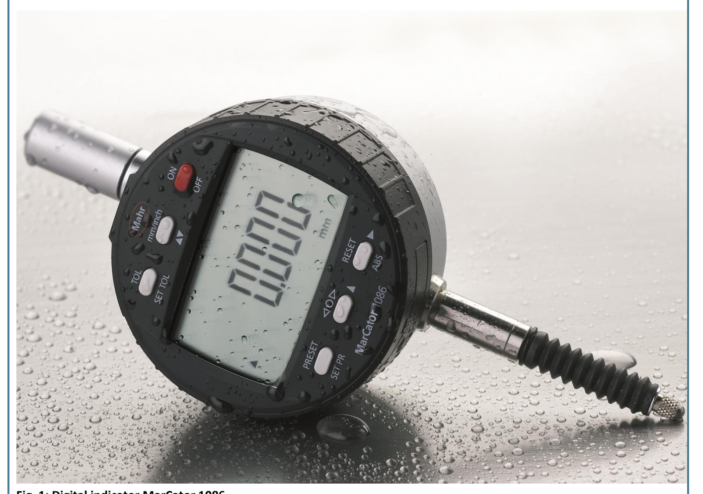
Fig. 1: Digital indicator MarCator 1086

In the US and UK, most gauging specifications were long ago gathered and documented to AGD Standards (American Gauge Design), but through the years these have been published under ANSI/ASME (American National Standards Institute/American Society of Mechanical Engineers).