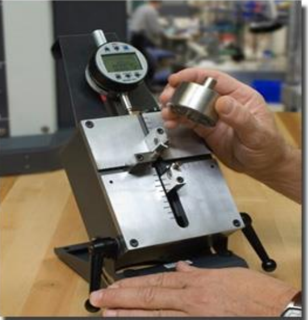
Fig. 2 and 3: Dial Indicators are basically mechanical amplifiers. Digital indicator 1087 R (right)