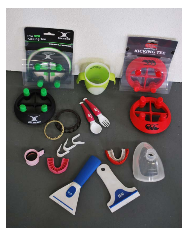
Injection moulded parts

Temperatures within the Euromould factory are subject to significant fluctuation. The heat produced by the injection moulding machines means that the temperature is usually high, however the thermal cycles of machines can also be enough to cause fluctuations of several degrees. In addition, seasonal variations can see temperatures rise to 28 °C (82.4 °F) in the summer and fall to 20 °C (68 °F) in the winter. Even with such variations Equator has been working well for Euromould, using its ability to