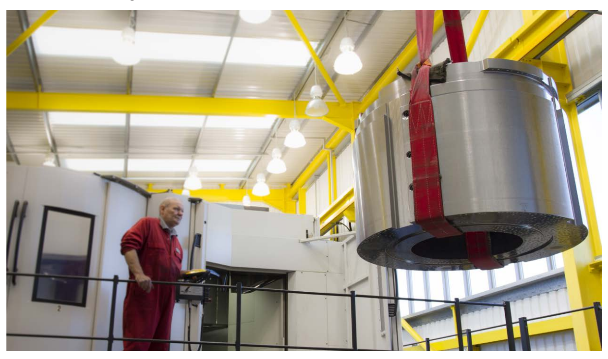
Intoco uses a Mazak INTEGREX e-1850V to machine components with large diameters

"Inspection Plus is great because you can do in-process measuring and adjust tool sizes automatically with the controller, so from a measurement perspective it takes a lot of problems away from the operators", explains Mr Parkins.