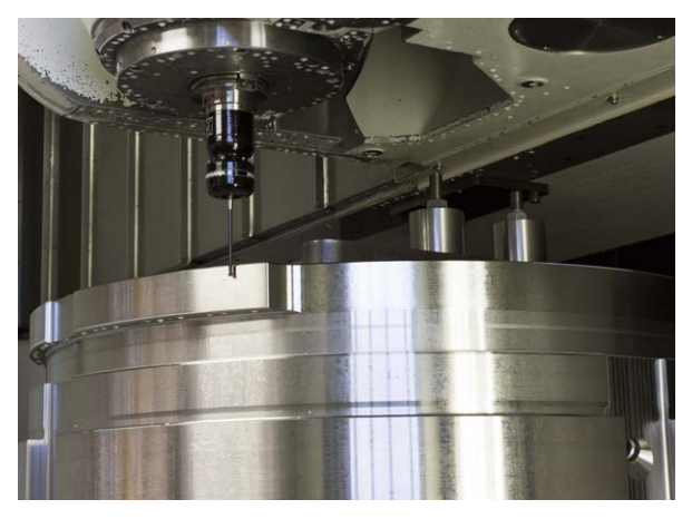
Intoco use Renishaw probing systems to measure large components during the manufacturing process

"Currently the metals extrusion industry commands 50% of our production capacity, but we also manufacture components for the oil and gas, green energy and pharmaceutical industries", says Wayne Parkins, Intoco's CNC Production Development Engineer. "We purchased the Mazak Integrex e-1850V to machine very large critical components up to 2300 mm in diameter and 1500 mm in height, manufactured in Alloy C22, super duplex and high alloy pre-hardened tool steels. With our clients not allowing any possibility of 'weld repair' in the event of a mistake 'right first time' on 1 off components is critical with no margin for error.