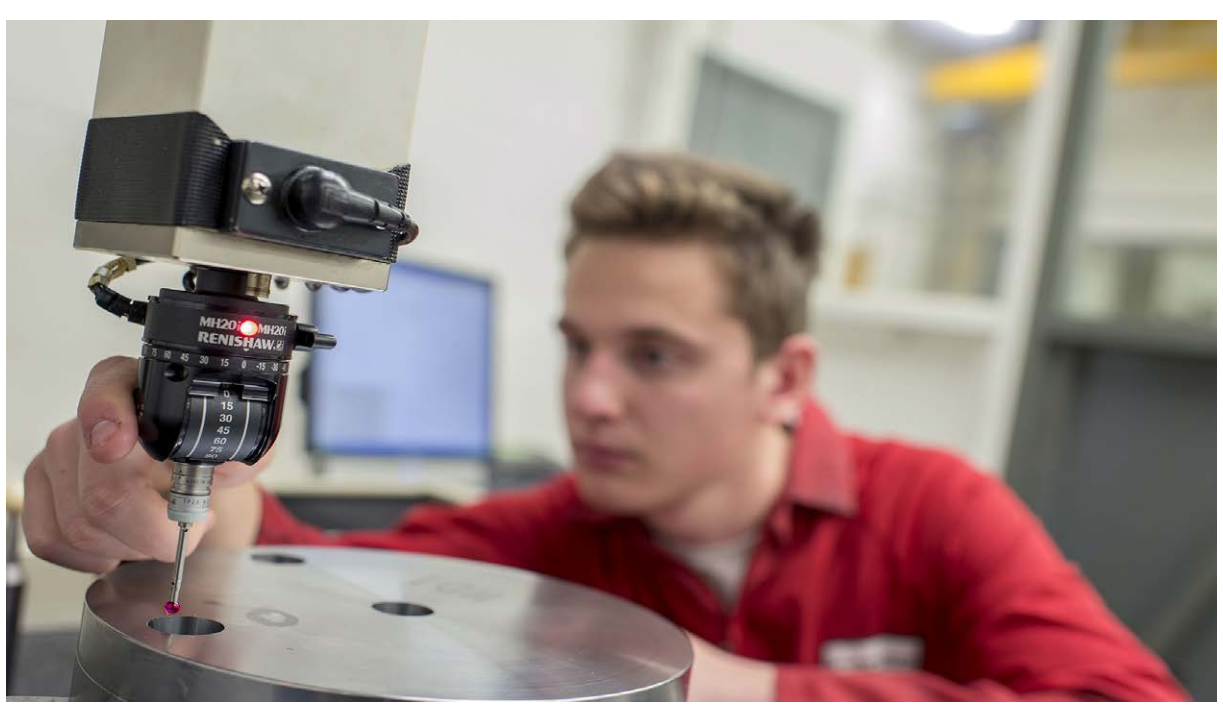
Intoco also uses the Renishaw MH20i manually adjustable probe on its co-ordinate measuring machine