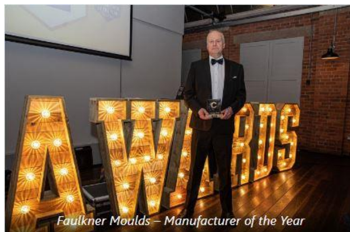
Faulkner Moulds – Manufacturer of the Year

The awards celebrate local business achievements, shining a spotlight on businesses that have “gone above and beyond”. The whole team discovered they were the winners at a glitzy event on 13 October at The Venue in Halifax. Faulkner Moulds was also one of just 6 finalists for overall 'Business of the Year' award.