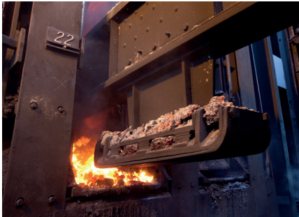
Coke oven, Toolox 44.