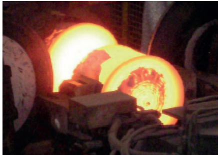
Rotating knives in blanks manufacturing, Toolox 44.