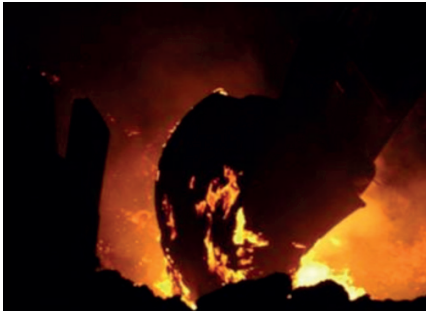
Hot slag bucket, Toolox 33.

Its unique properties makes Toolox a perfect wear plate for metallurgical industries, cement industries, in power plants and other areas where the application is exposed to both wear and heat.